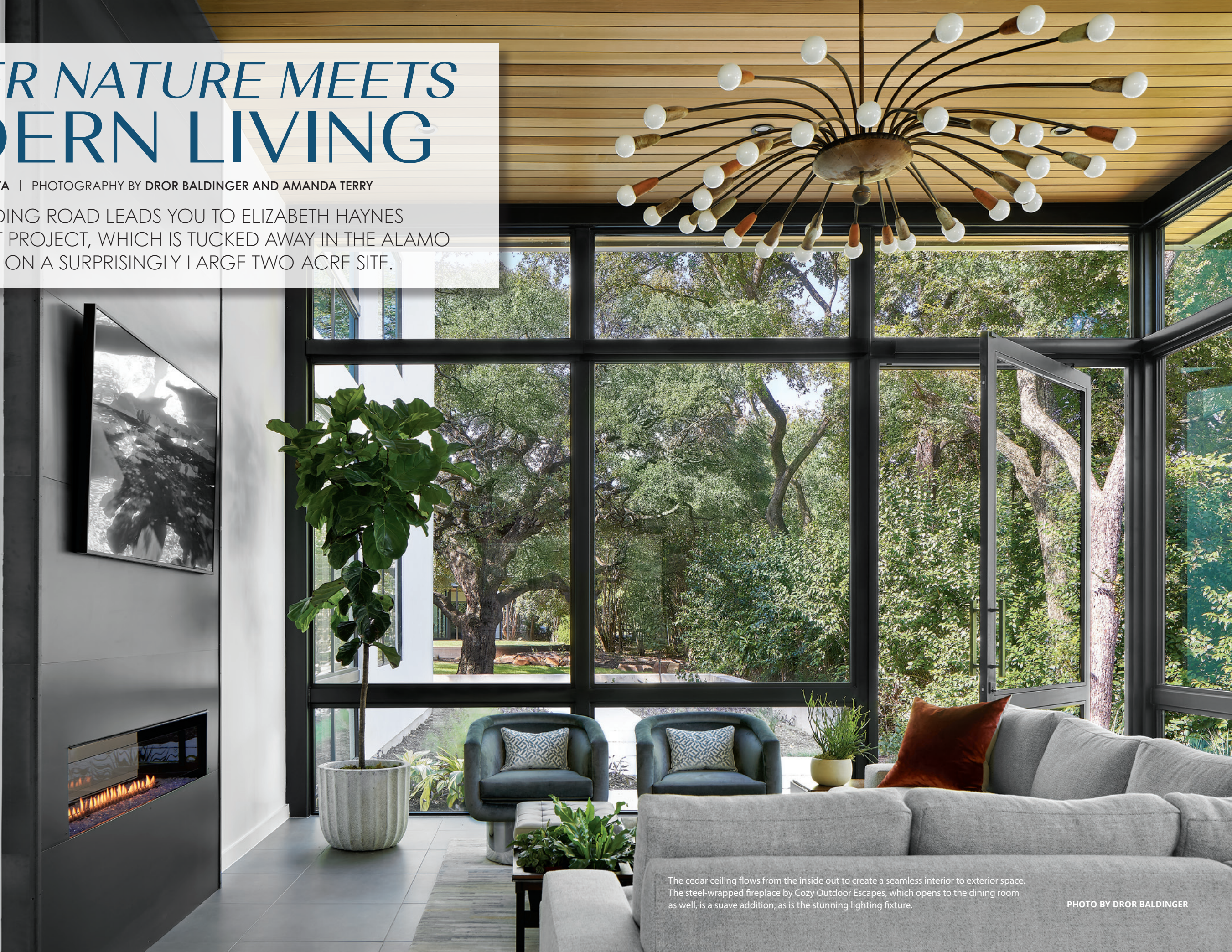
The cedar ceiling flows from the inside out to create a seamless interior to exterior space. The steel-wrapped fireplace by Cozy Outdoor Escapes, which opens to the dining room as well, is a suave addition, as is the stunning lighting fixture.